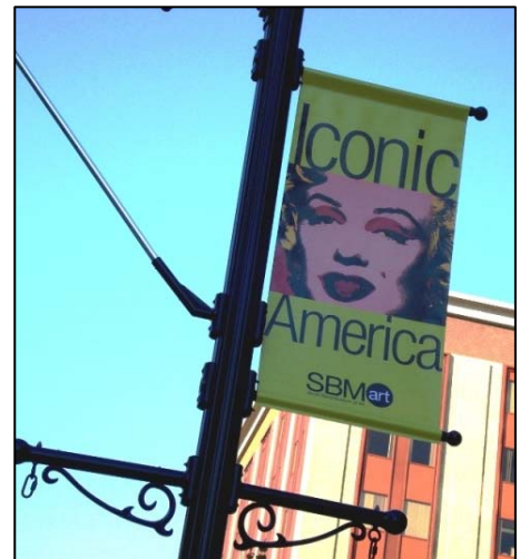
Banner produced by the South Bend Museum of Art as part of the DTSB pilot program for light pole banners.